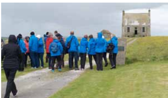
Arctic Canda Tours