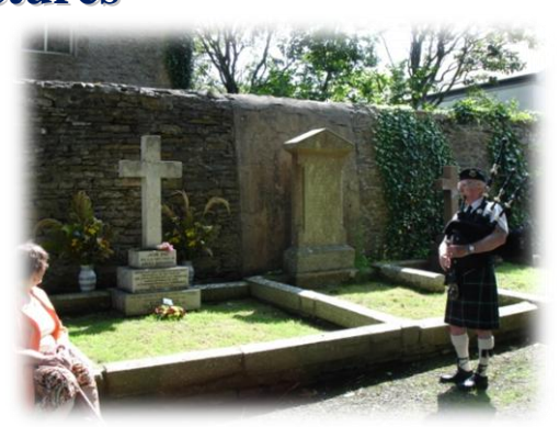
July – Graveside tributes